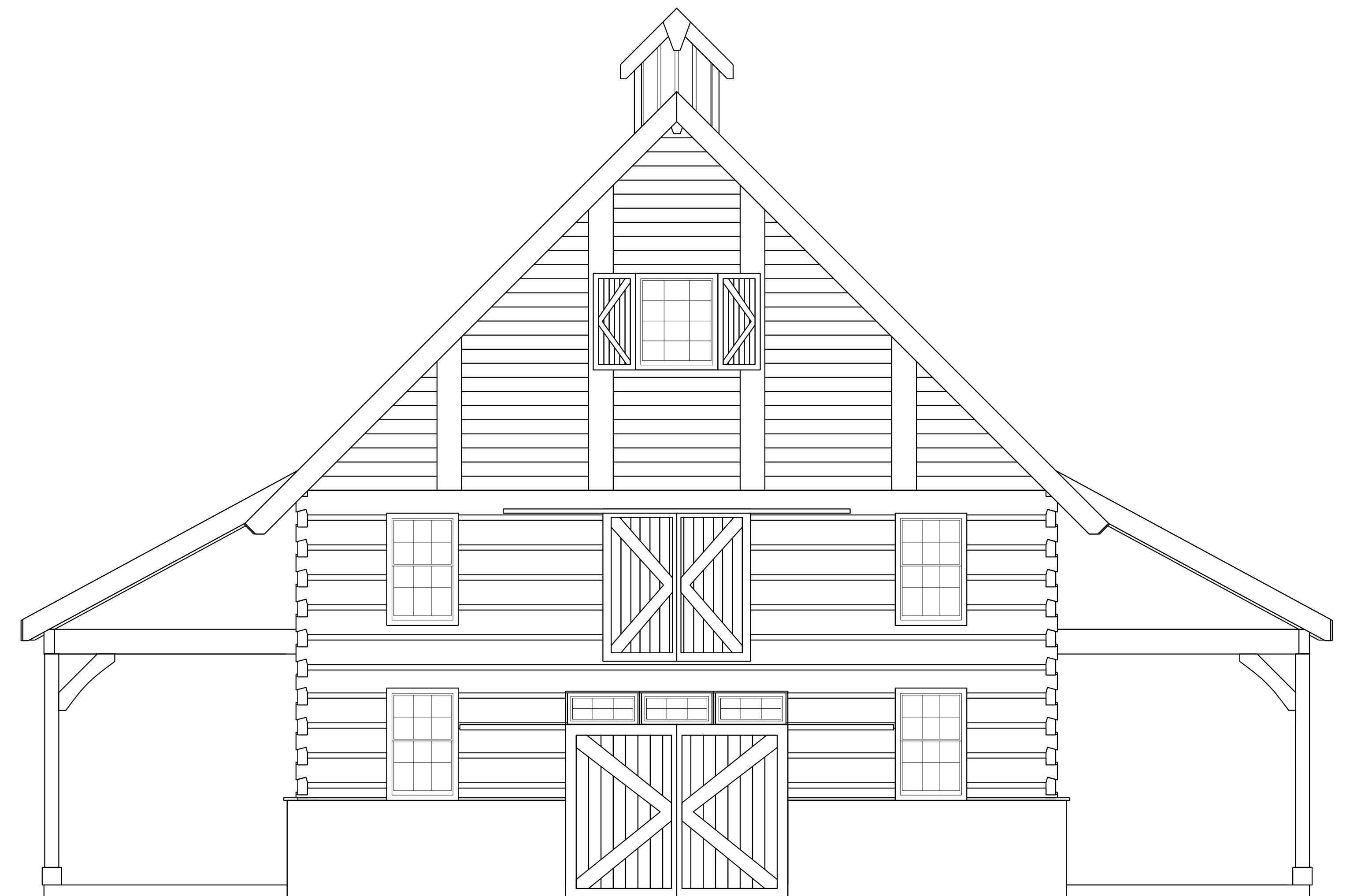
PLAN LEFT ELEVATION